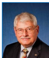
MONTE DEL MONTE USA